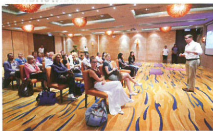
At Hyatt Regency Phuket Resort

Straight after our arrival, we embarked on an active programme: we learned to mix our own cocktails, the basics of yoga, as well as how to prepare small-scale catering with an aperitif. The evening programme included artistic dance performances and a dinner with international specialities at a local restaurant Sunset Grilled with a view of the whole bay. Afterwards, we moved to the famed Patong Beach with its nightlife, dancers, prostitutes, bars and ladyboys, about 20 minutes away from the hotel by tuk-tuk or taxi.